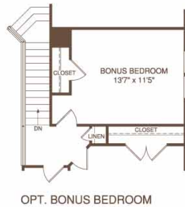
OPT. BONUS BEDROOM